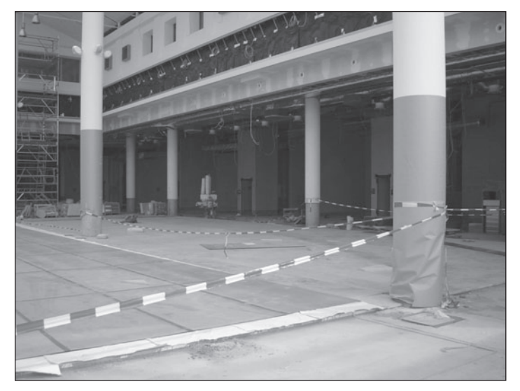
Figure 1: Comparison of the KMCC Food Court Area

construction completion. Moreover, because LBB-Kaiserslautern has not met earlier construction schedules and the estimated construction completion date has continued to slip, we are concerned about LBB-Kaiserslautern's ability to manage actions needed to achieve the January 2009 estimated construction completion date.