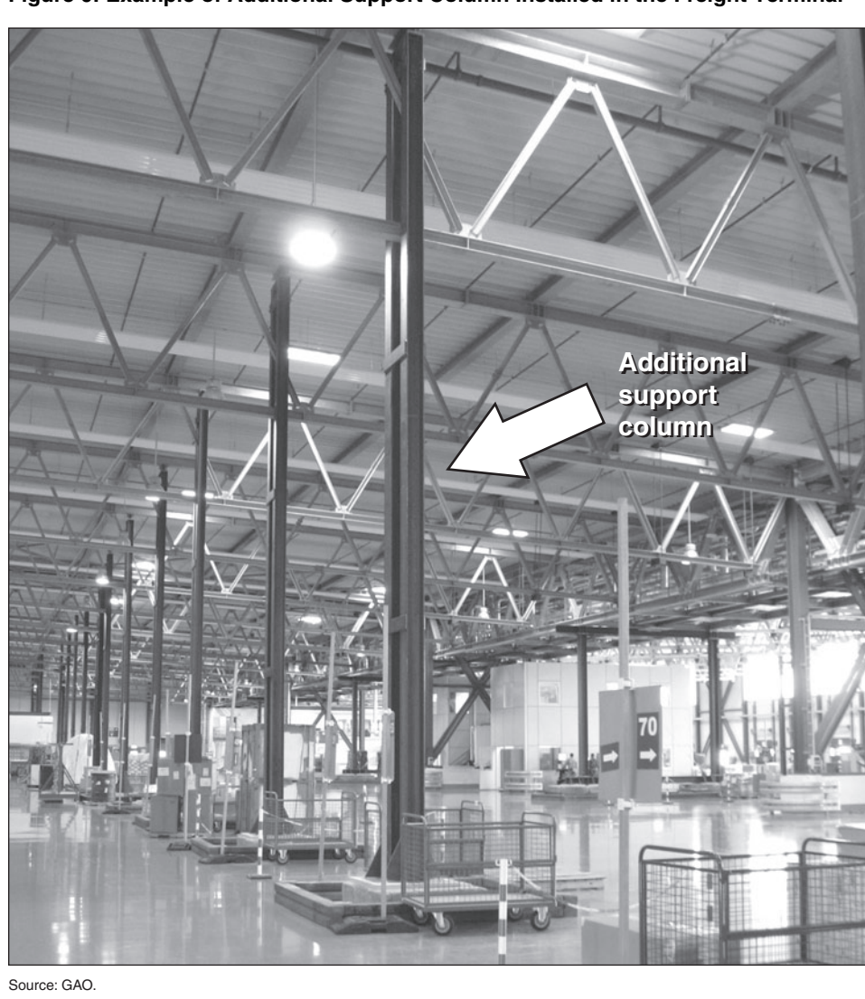
Figure 6: Example of Additional Support Column Installed in the Freight Terminal

• Hot cargo pad. A large concrete area intended to be used for loading live munitions onto aircraft destined for overseas locations such as Iraq and Afghanistan was recently built near the Ramstein Air Base runway. However, when building the concrete pad, contractors did not install dowels between adjacent concrete slabs as is typically done in this type of construction. Because the dowels were not installed, Air Force officials stated that differential settling of the concrete slabs could result in damage to the cargo pad and reduce its useful life. The Air Force is currently