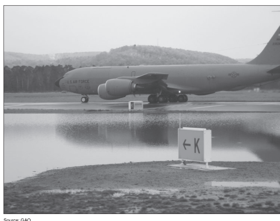
Figure 5: Example of Large Pond Next to Ramstein's South Runway