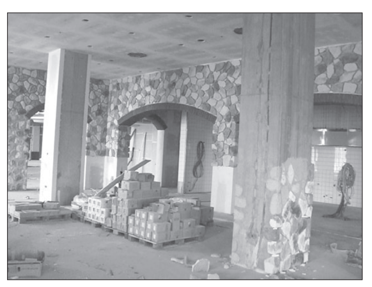
Figure 2: Comparison of the KMCC Name-Brand Restaurant